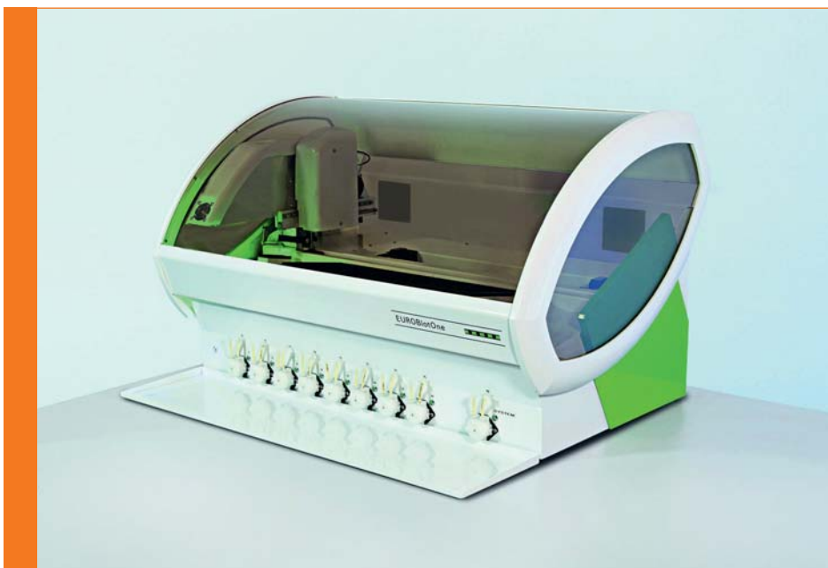
Figure 2. EUROBlotOne device